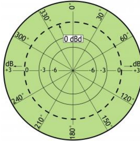
TYPICAL RADIATION PATTERN (H-PLANE)